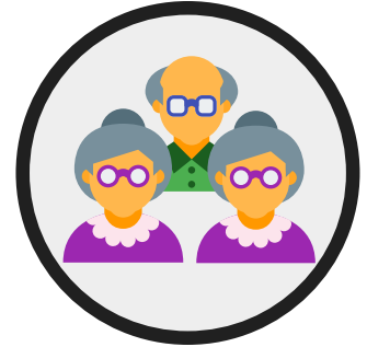
Residential Care Homes by Number of Incidents

In 2015, 1% of older adults in Residential Care in British Columbia experienced an act of "Resident on Resident" aggression