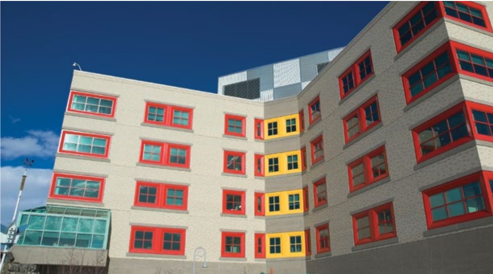
Alberta Childrens Hospital – Calgary, Alberta