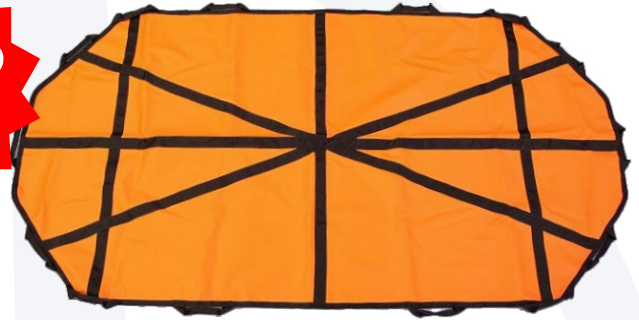
Bariatric & Standard