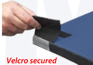
Velcro secured corners