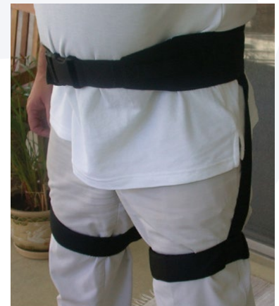
Lift Belt with leg support

*Buy 3 belts of same size/type and receive 1 belt of same size/type free.