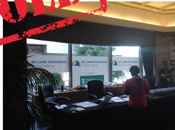
Figure 1 Title Sponsor branding will be located behind registration desk