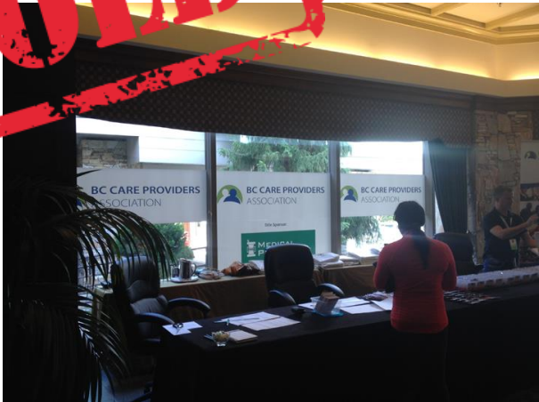
Figure 1 Title Sponsor branding will be located behind registration desk