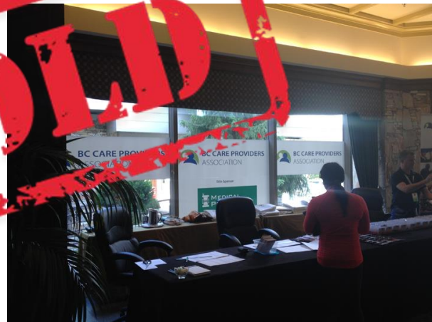
Figure 1 Title Sponsor branding will be located behind registration desk