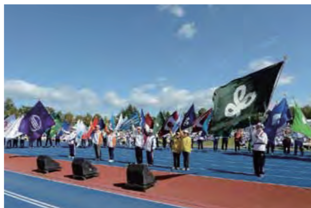
Opening ceremony of "Nenrinpic"

An increase in long-term care expenses due to the progress of aging can affect the insurance premiums of both the elderly and the actively working generation. In addition to raising people's trust in the system, making the system fairer will be necessary in the future. With the comprehensive reform of social security and tax, establishing an integrated community care system and ensuring the sustainability of the long-term insurance system will be the main subjects of future discussions.