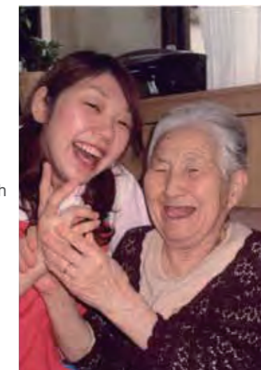
Thank you, these hands are valuable

long-term care sites to continue to work for a long time with pride is therefore necessary. The Bureau is working towards raising the wages of those engaged in long-term and establishing an appropriate career path for them.