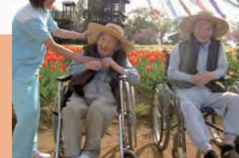
Full of smiles, full of spring

The Health and Welfare Bureau for the Elderly is working towards establishing an integrated community care system that will enable people to continue to live in their home town to the end of their lives with a sense of security once they need long-term care.