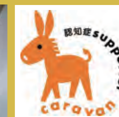
"Captain Donkey," the mascot of a dementia supporter caravan