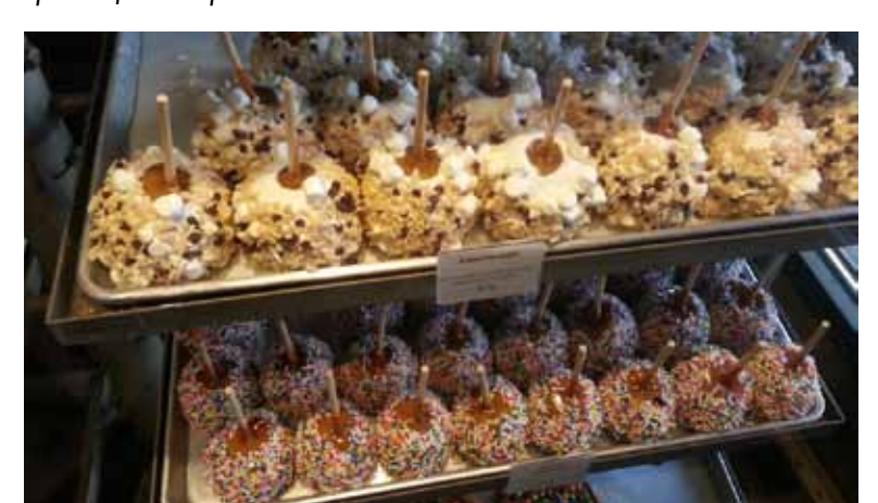
Baked goods on the "foodie" tour