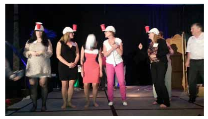
Delegates participate in evening dinner entertainment