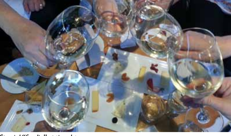
Special "foodie" optional tour