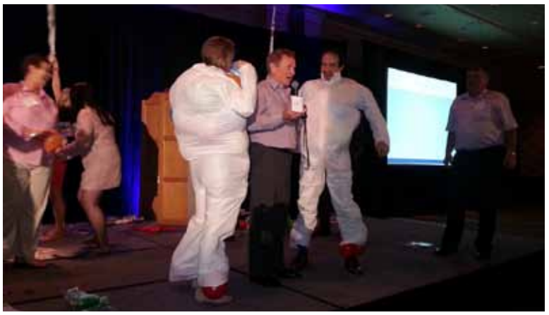
The special dinner events trigger some laughs