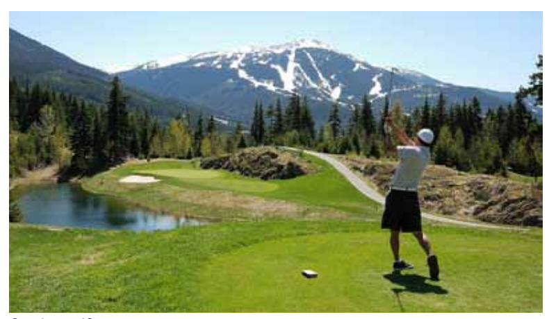
Sunday golf tournament