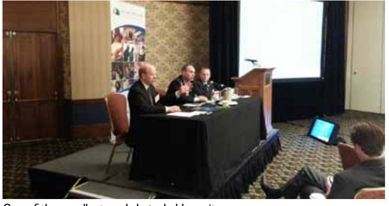
One of the excellent workshops held on site