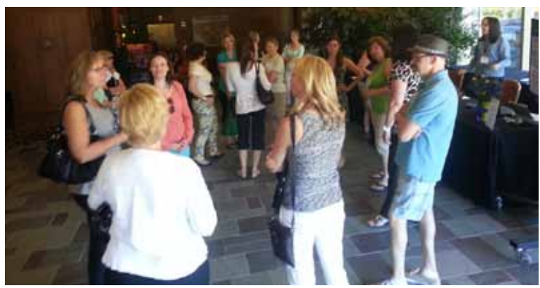
Group waits to depart for optional tour