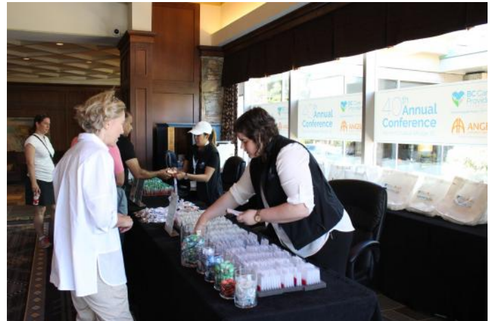
Title Sponsor branding will be located behind registration desk